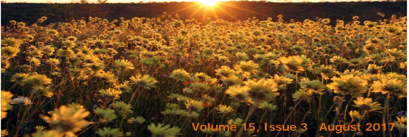
PHOTO: Coalseam Conservation Park, WA in September 2016