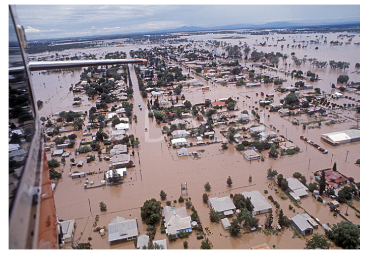
Flooding in NSW

CSIRO, the Bureau of Meteorology and the Department of the Environment and Energy have provided a comprehensive portal for climate projection science, data and information called <u>Climate Change in</u> <u>Australia</u>. This website includes regional climate projections, a publication library, guidance material and a range of interactive tools.